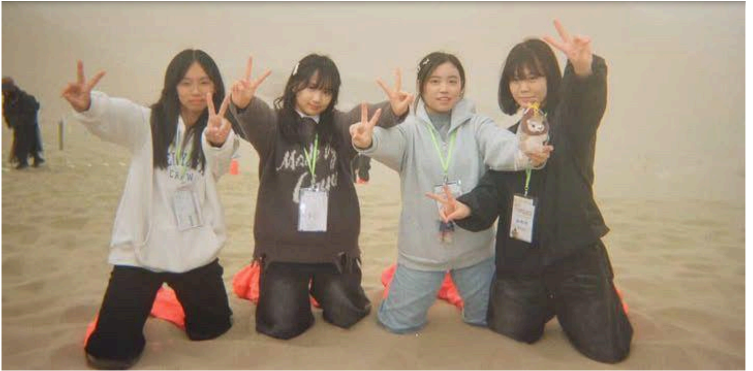
On Mingsha Mountain, we marvelled at the vast desert landscape and its unique natural beauty.