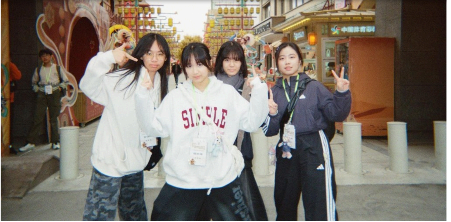
At Shazhou Night Market, we experienced the lively atmosphere and distinctive local culture of Dunhuang.